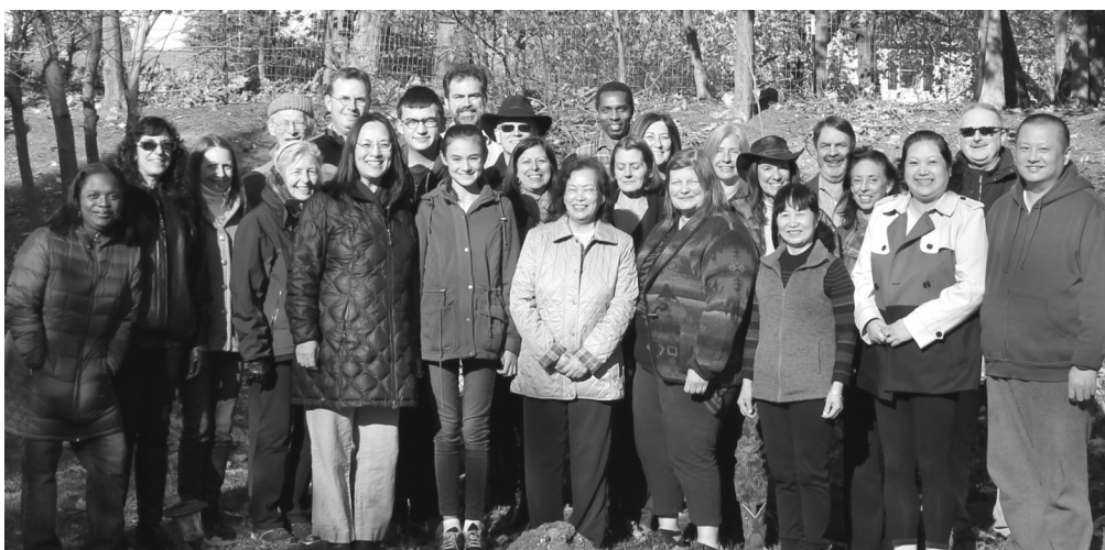
The Family of Qi Healers from the Chinese Healing Arts Centers

Qi Healer's Day—Sunday, November 14, 2016